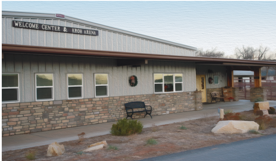
Kroh Arena renovation and Welcome Center completed in 2016

In 2015 Hearts & Horses received 1 million dollars between grants, individual gifts and in-kind donations from area businesses, contractors and manufacturers to renovate the 35 year old Kroh Arena and build a welcome center attached to the existing structure.